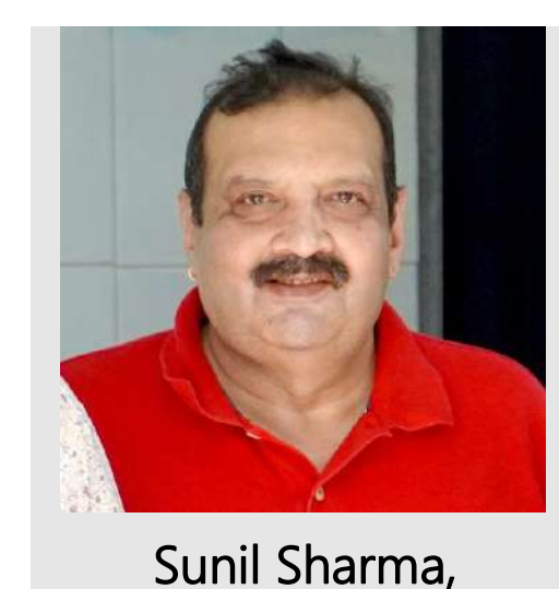
Producer and Partner, Pinaka Mediaworks

"Each film has its own space amongst the audience. I would like to thank every subject matter, writer, actor, technician, producer, exhibitor, release partner, festival programmers & directors, and the audience for believing in the films and standing with us throughout the journey across the globe. I am working on my next set of films, and I hope they are received with as much affection as the current ones. The acclaims and multi-releases this month have just ensured another spike into the momentum of making quality films and showcasing them on quality platforms."